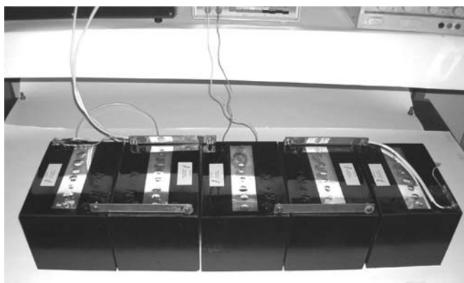
Fig 1. High-voltage supercapacitor set 1000 V, ( 1000PP-90.1,5)

The set includes 5 modules x 200 V connected in series (Fig. 1, 2).