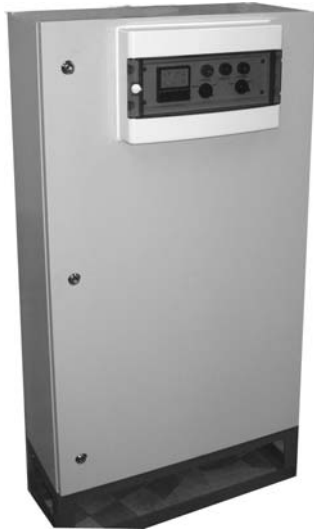
Fig 4. KTN-100 (100 A, 220 V)

General view of the stand KTN-100 is given at Fig.4.