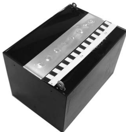
Fig 2. Module 200 V, 18 kOhm. (the ruler on top is given in centimeters)